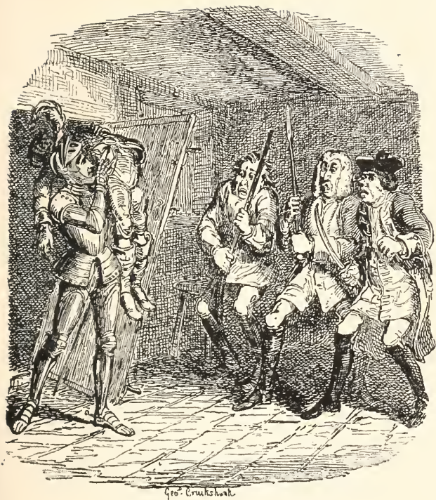
The Alarm of Crowe and Fillet at the Appearance of Sir Launcelot.